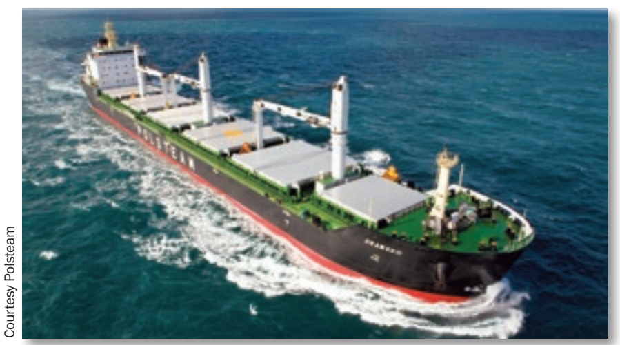
The Drawsko heads across the Atlantic to the Twin Ports.

The opening of each Seaway shipping season brings heightened anticipation to the Twin Ports, from the maritime community to local residents. From the time the first saltwater vessel arrives in April, curiosity abounds. In 2017, 61 overseas vessels called on Duluth-Superior, with export totals of nearly 1.1 million short tons of cargo, primarily grain products. Like the freshwater lakers, many salties make regularly scheduled visits and follow established trade routes within the Great Lakes.