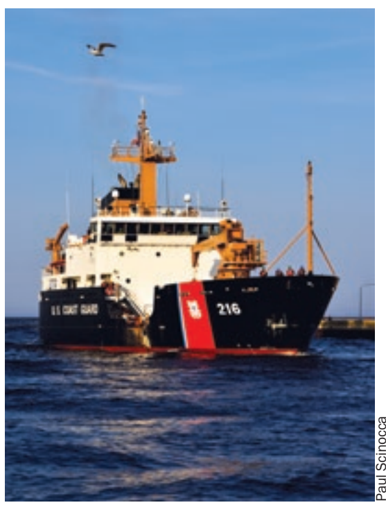
ALDER heads home.