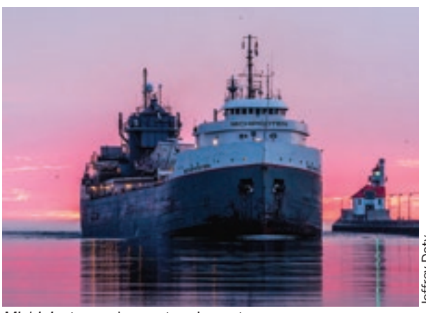
Michipicoten makes a stunning entrance.