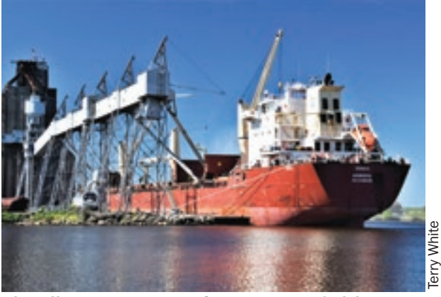
After offloading cement, the Sunda moved to CHS for wheat.