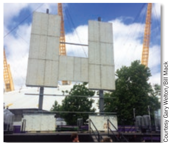
The "H" was reassembled in London