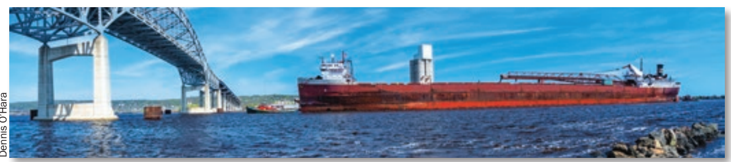
Skies were sunny in May when the freighter was towed from Loon's Foot Landing to Fraser Shipyards.

The American Victory's unique legend will always occupy a special place in the annals of Great Lakes history and, as importantly, in the hearts of mariners across the continent.