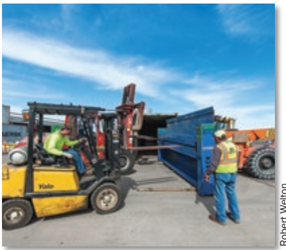
Five stories of steel are securely crated in Duluth.