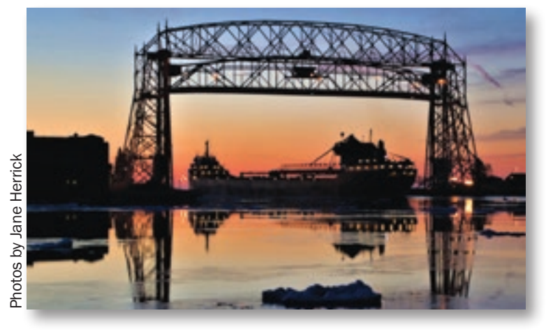
I'm looking forward to her growing up and always being a part of what I do, going down and taking pictures of the ships.