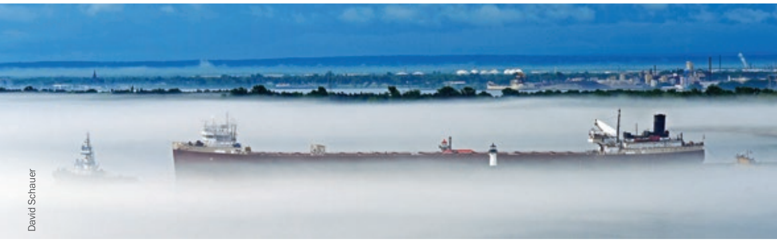
Fog rolled in almost on cue as the American Victory ("Victo") left the Twin Ports on her final voyage June 17.

The American Victory is headed for a Turkish scrapyard to be dismantled and recycled after a long, colorful and sometimes tragic career.