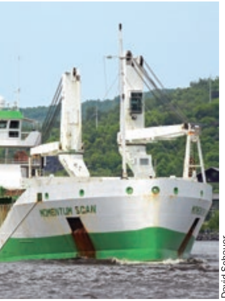
First visit: Momentum Scan loaded bentonite.