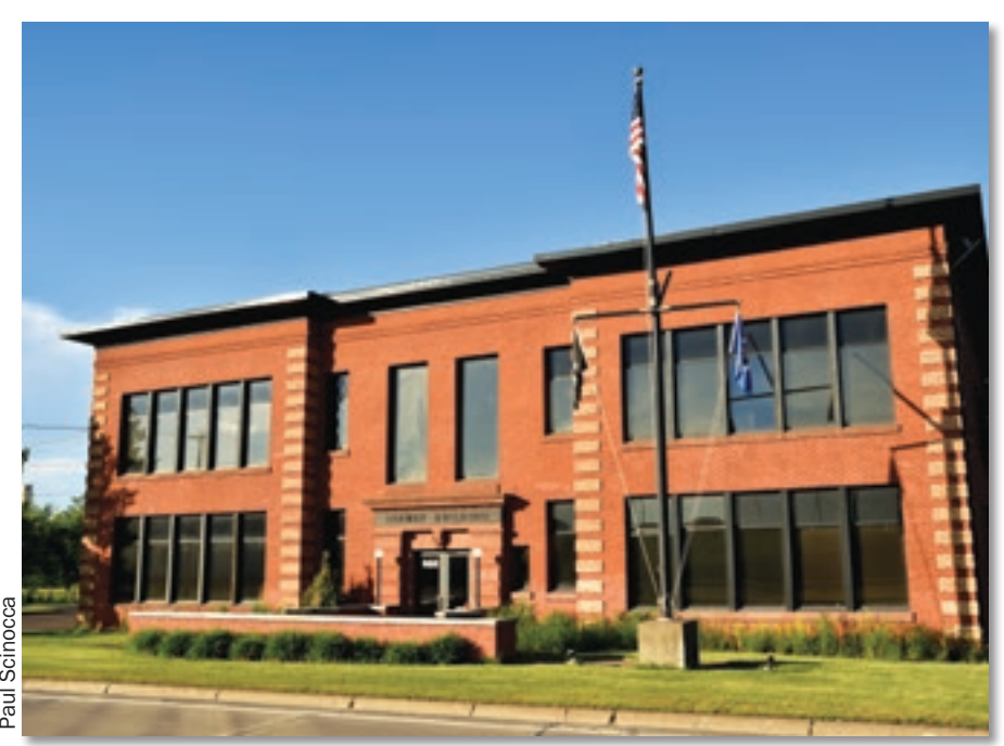
The Seaway Building holds the promise of a permanent home.

The Duluth Seaway Port Authority is charting a course that will return its offices to the working waterfront in two years.