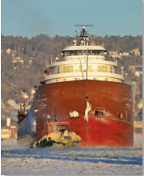
Interlake's Kaye E Barker gets a tug assist from Great Lakes Towing's North Dakota. The companies are new Green Marine members.

Green Marine offers a roadmap for shipowners, port authorities, terminal operators and shipyards to voluntarily reduce their environmental footprints. Its rigorous environmental certification process uses 12 performance indicators that include greenhouse gases, air emissions, spill prevention, waste