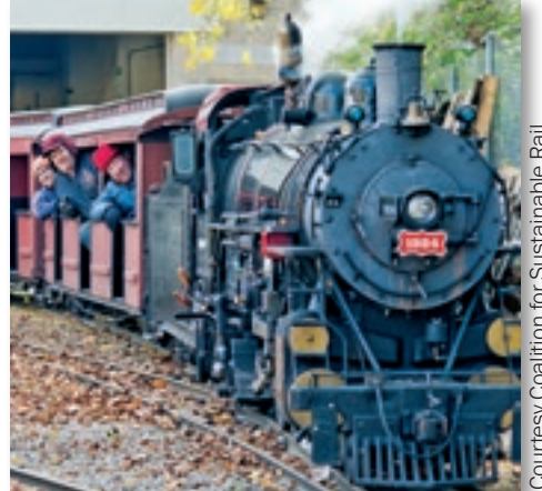
NRRI researchers ride the Milwaukee Zoo train during biofuel testing.

Meanwhile, researchers at NRRI keep chugging along, seeking new opportunities to advance biofuel development. Current work involves using a high pressure gasification process to convert the solid biofuel into a synthetic natural gas. This research