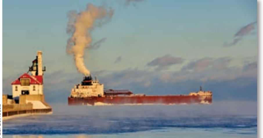
With the surge in iron ore loadings, the Mesabi Miner (with her signature steam plume) made several visits to the CN Duluth Dock.