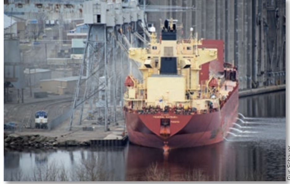
The Federal Katsura is de-ballasting to maintain stability as grain is loaded into its cargo holds.

"We are excited to continue our objective performance evaluations of technologies and policies to protect great waters," said GWRC Principal