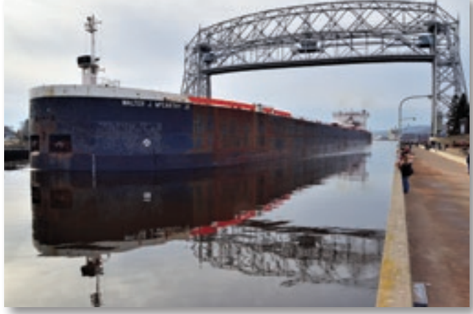
With no ice in sight, the Walter J. McCarthy Jr. departs the Twin Ports Dec. 3 with a load of coal for St. Clair, Mich.