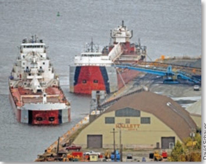
The Great Republic arrives with a load of limestone while the Cason J. Callaway loads sinter ore at Hallett Dock 5 in Duluth.

Sinter is critical to blast furnace steel production. It is layered along with lump iron and pellets to maintain a porous