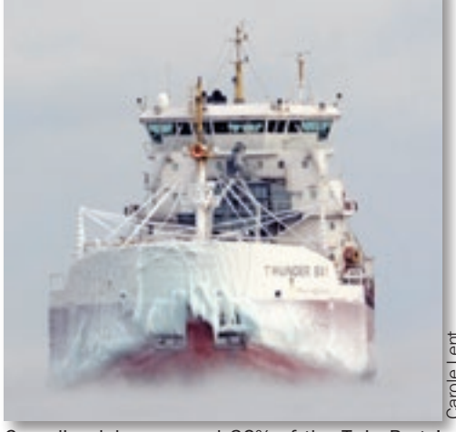
Canadian lakers moved 36% of the Twin Ports' iron ore shipments in 2017.