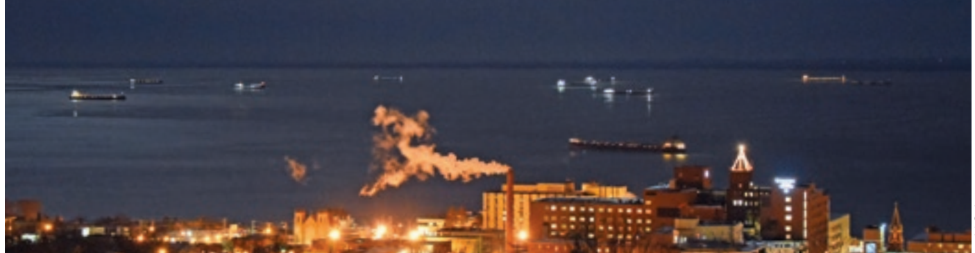
Ten ships at anchor under a New Year's full moon wait for temps to rise and berths to open up.