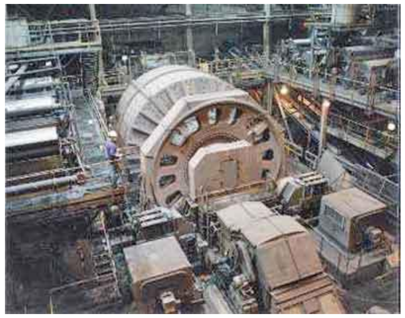
In a modern taconite processing facility, nine-inch diameter crude ore is ground to a powdery consistency in grinding mills of up to 36 feet in diameter.

test the magnetic separation of iron ore. Jackling, who had developed the massive Bingham Canyon copper mines in Utah, spent much of 1917 and 1918 shuttling back and forth between New York and Babbitt, Minnesota, overseeing the progress of the project. Jackling's crews were able to improve the iron content of taconite from 32 percent to 62.2 percent but they were never able to make the costs competitive with natural ore.<sup>2</sup>